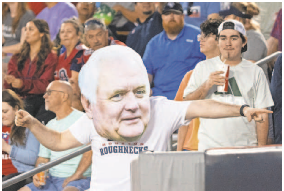
A Roughnecks fan dances while wearing a head coach Wade Phillips mask during Houston's win over the Renegades.

Former NFL coach Wade Phillips and the Roughnecks emerged victorious from an intra-state tussle with the Renegades on Sunday in Texas. The game featured a healthy amount of trash talk and bragging rights stakes – as evidenced by the live mics on the field – but Houston kept its head down in the second half to keep Arlington in the rearview mirror. After an Arlington end-zone interception was reversed due to illegal contact, Houston took advantage of the second chance and hit paydirt to build a nine-point lead. The Renegades' last-ditch effort fell short, giving the Roughnecks a 23-14 win and moving them to 2-0. Both teams got familiar with each other during the preseason due to the relatively close proximity of the cities, and it feels as though the bad blood isn't going away soon.