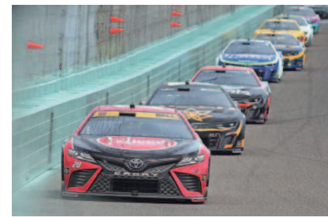
Christopher Bell was victorious Sunday at Homestead-Miami Speedway.